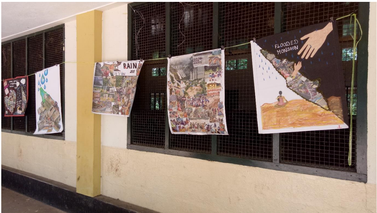
Collage competition on “Monsoon Days in Kerala”