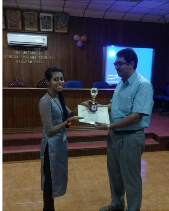
Winners of PPT Competition on ‘Common Monsoon Diseases in Kerala’