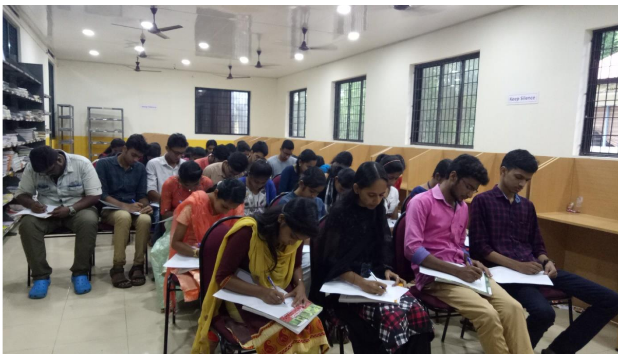
A view of the Quiz Competition organized to commemorate Dr. A.P.J. Abdul Kalam 26.07.2019