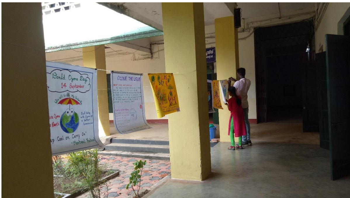
Poster Competition - International Ozone Day celebration 2018