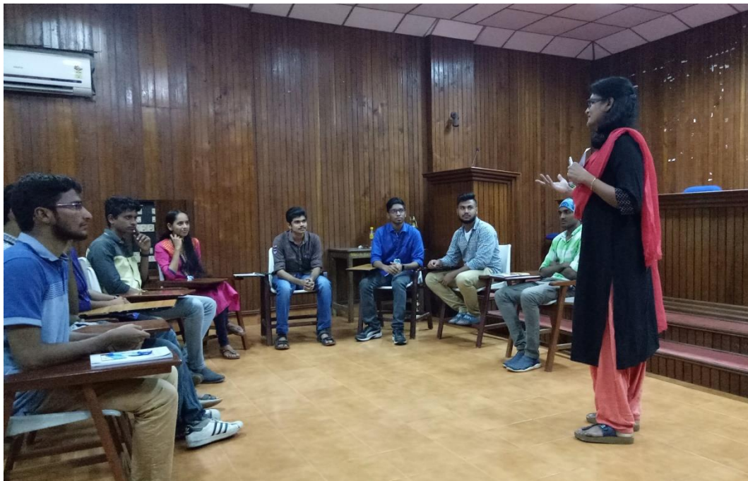
A view of Debate Competition conducted on 06.08.2019