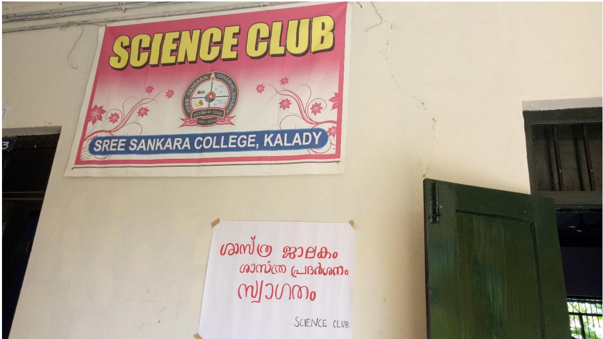
Views on the Science Exhibition organized in connection with ‘Sastra Jalakam’