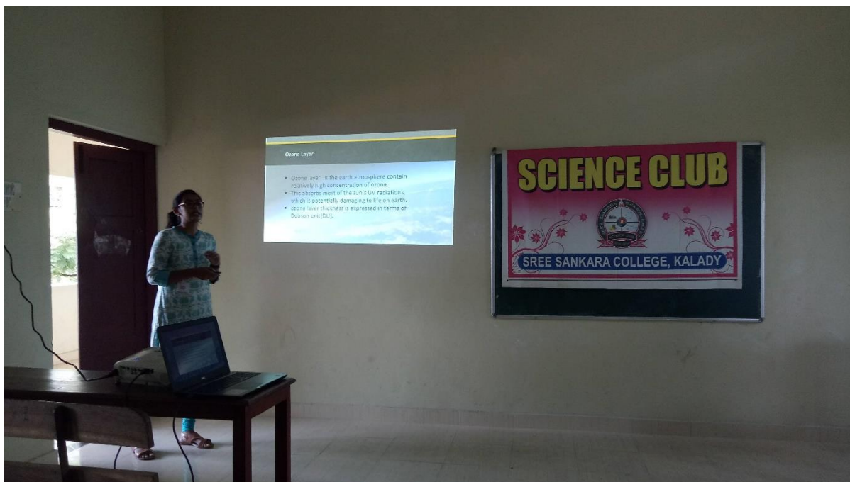
Power Point Presentation Competition - International Ozone Day celebration 2018