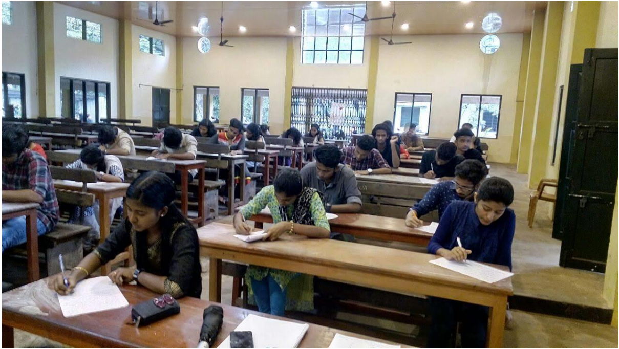
Essay Writing competition on ‘The World Beyond War’ to commemorate Hiroshima Day