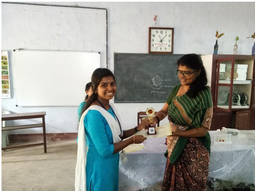
Winner of Collage Competition on Women in Science’ organized as part of National Science Day celebration on 28.02.2020