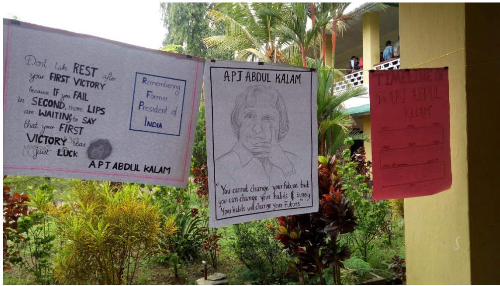
Posters made by students to commemorate Dr. A.P.J. Abdul Kalam