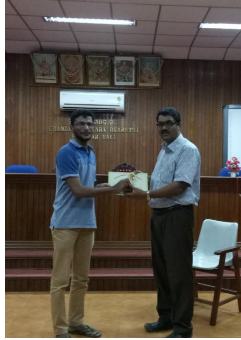
Winners of of Debate Competition conducted on 06.08.2019