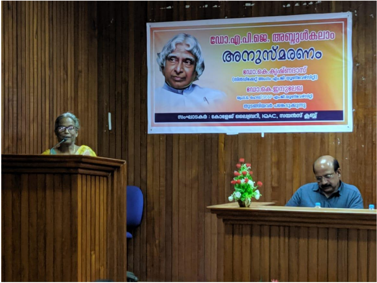
Views of the invited talk organized to commemorate Dr. A.P.J. Abdul Kalam 29.07.2019