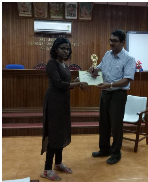
Winners of of Collage Competition conducted on 06.08.2019