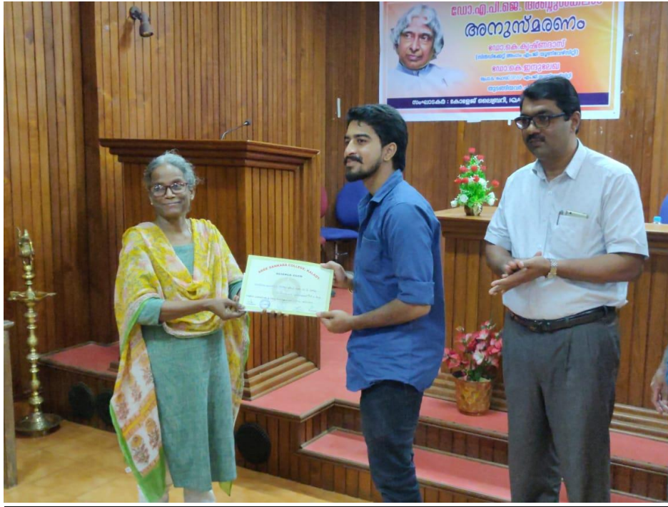
Winner of the Quiz Competition organized to commemorate Dr. A.P.J. Abdul Kalam